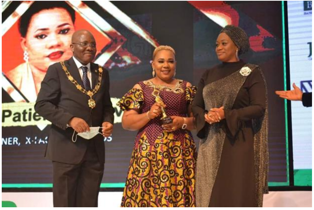
PRESENTATION OF AWARDS