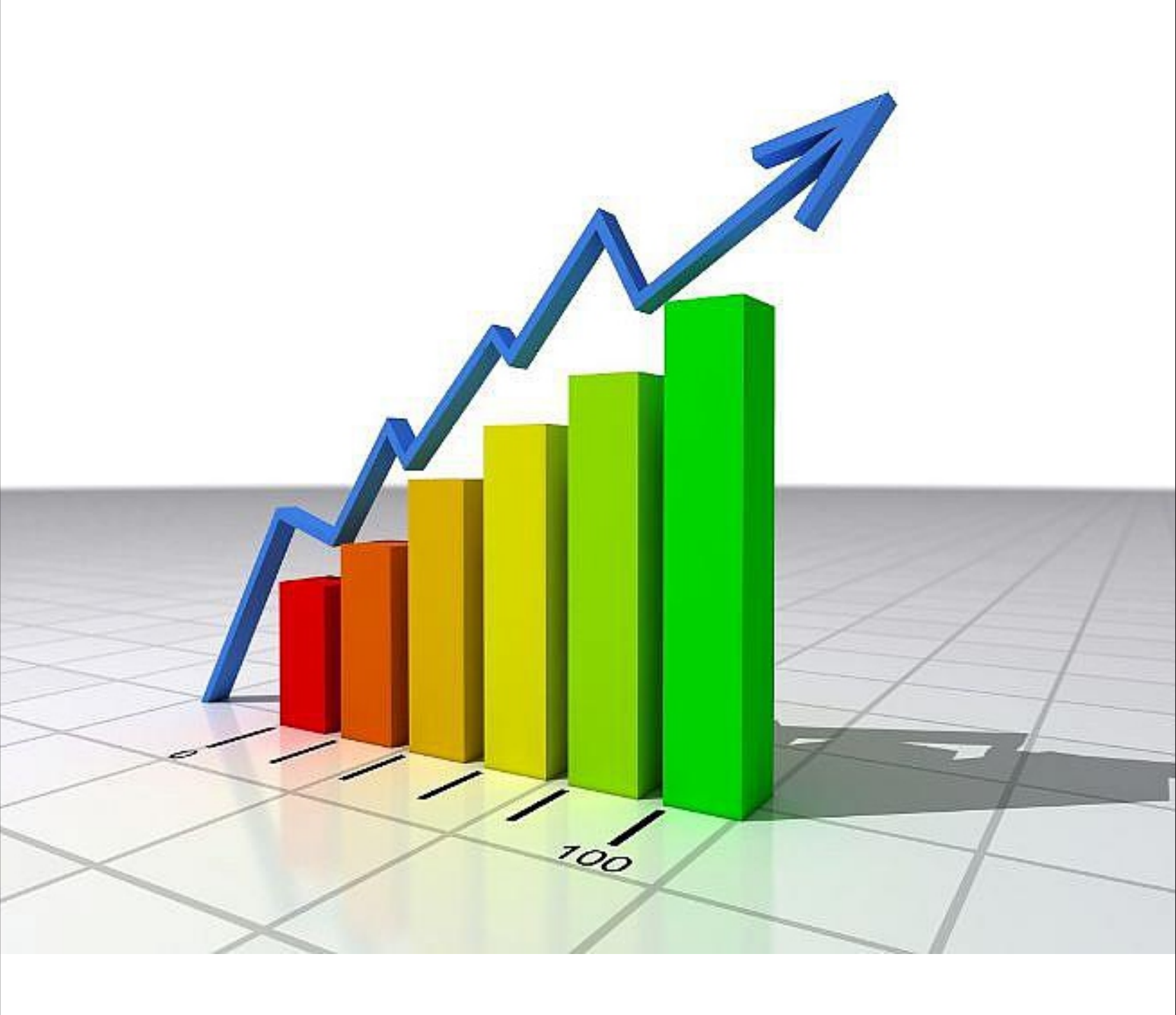
Results of Analysis