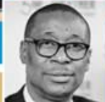
Dr. Okechukwu Enelamah Hon. Minister of Industry, Trade and Investment